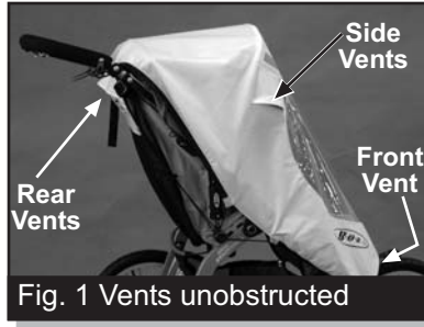
Fig. 1 Vents unobstructed

6. Stretch the elastic cord on each side under each respective black shock knob as shown in Fig. 7. There is an opening mid way up each side (with silver reflective fabric on each